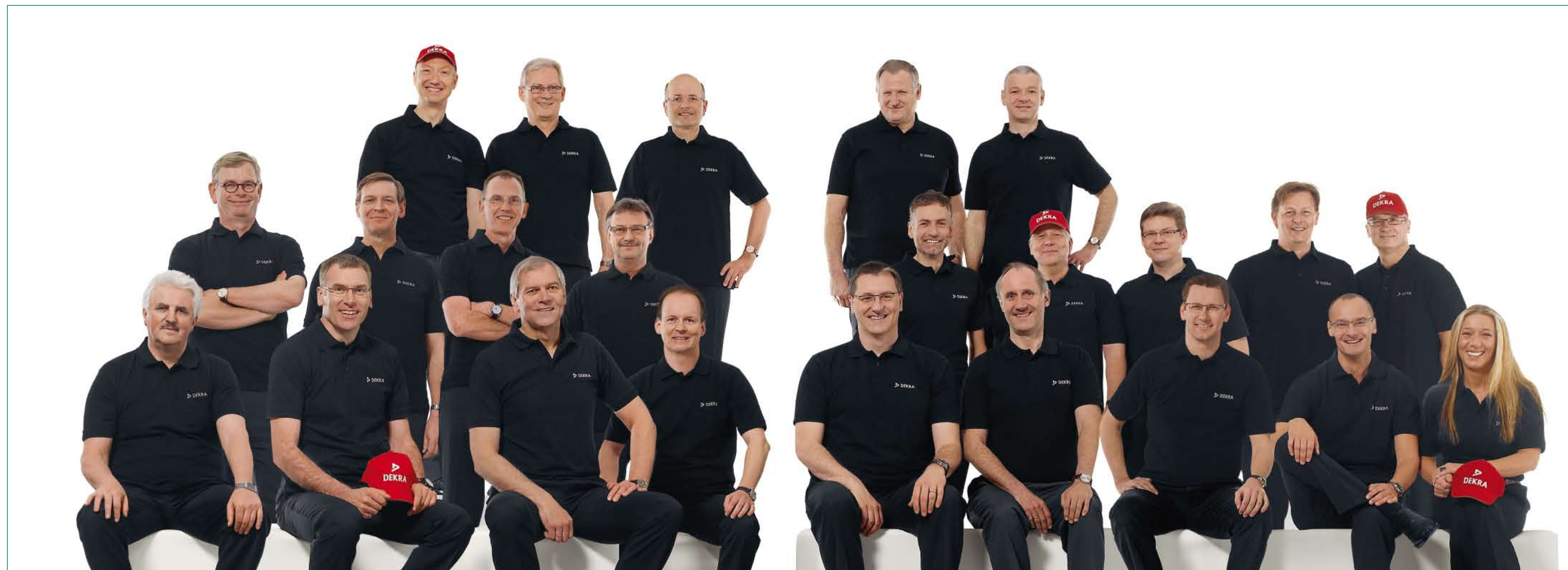
Front row, from left